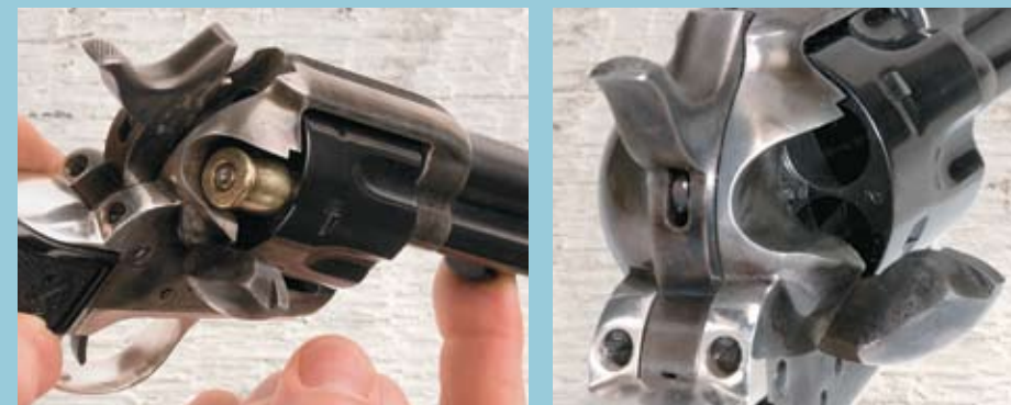
The Gunfighter is intended as an upgrade from a stock entry-level gun for competition. Internally, the revolver has a set of Wolff U.S.-made springs. Otherwise, the gun remains faithful to the original Model 1873 with its loading gate on the frame's right side.

On the whole, the Gunfighter represents a nice variation on what was already a fine gun—Navy Arms' Model 1873. The bluing is well executed and the silver plating handsome. Moreover, the functional improvements of the checkered grips and Wolff springs are practical and comforting. Cowboy Action shooters take pride in their distinctive characterizations and now they have a distinctive 1873 revolver.