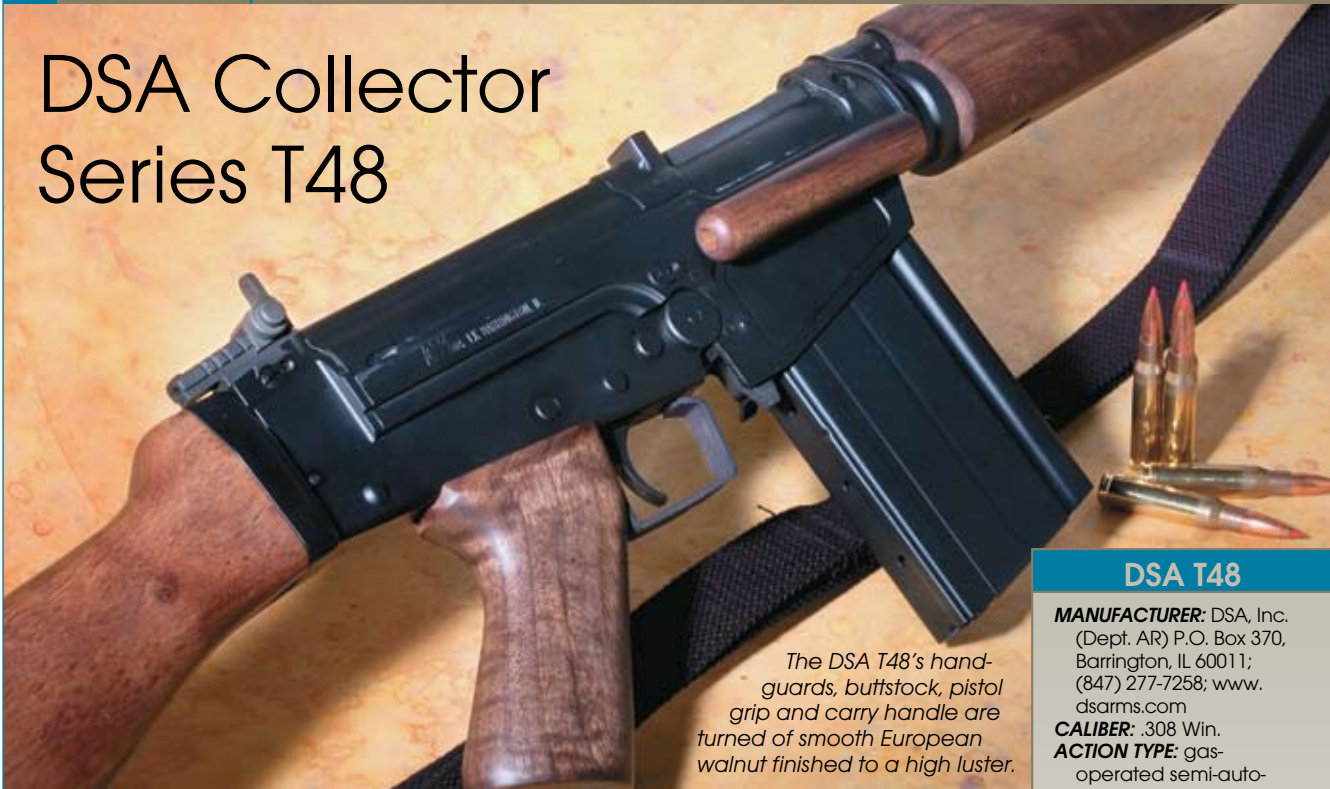
The DSA T48's handguards, buttstock, pistol grip and carry handle are turned of smooth European walnut finished to a high luster.

D SA expands its broad line of FAL-type rifles with the SA58 Collector Series. Each of the four models—the Congo, Para Congo, G1 and T48—represents a unique milestone in the history of the Fusil Automatique Legere . DSA recently sent us its rendition of the T48, one of those fascinating “what ifs” in military history, for testing and evaluation.