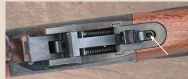
Unlike original rimfire 1885s, the new gun has an ejector-only mechanism. On the tang's top rear is a shell deflector (top, arrow) that directs the spent case either to the left or right, or it can halt the case for easy case recovery. Right behind the trigger is the single-stage trigger's adjustment screw (above, arrow). Measured pull was 4 lbs., 4 ozs.