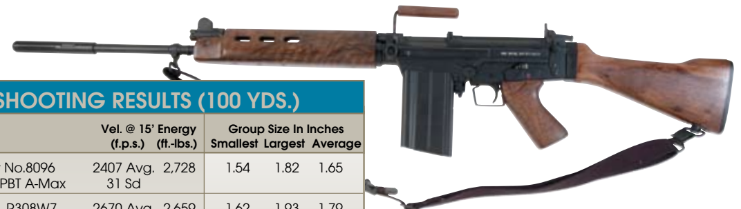
A handsome rifle, DSA's T48 also accurately represents a unique milestone in the history of the Fusil Automatique Legere .

The FAL's gas-operating system makes use of