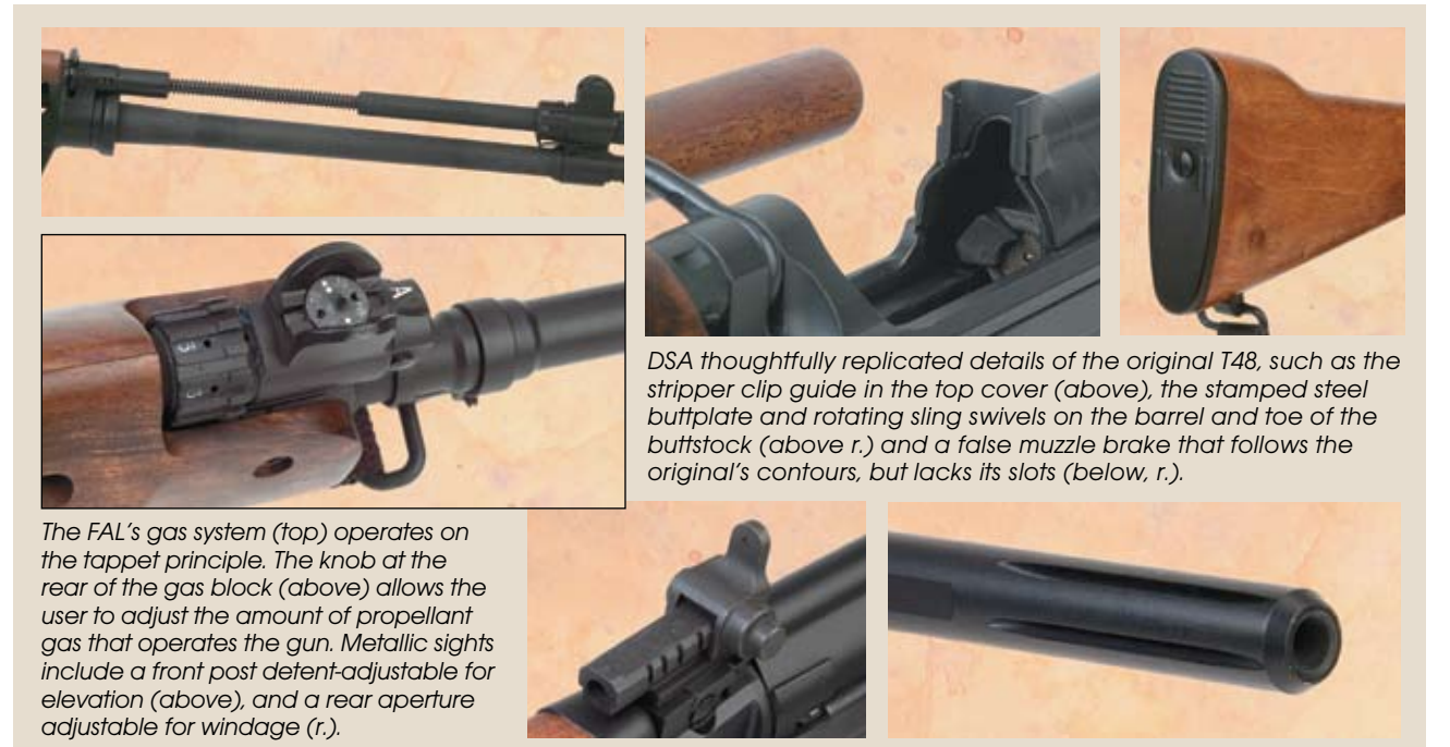
DSA thoughtfully replicated details of the original T48, such as the stripper clip guide in the top cover (above), the stamped steel buttplate and rotating sling swivels on the barrel and toe of the buttstock (above r.) and a false muzzle brake that follows the original's contours, but lacks its slots (below, r.).

No doubt, the T48 will appeal most to those who can appreciate both the fine workmanship and precision fitting DSA has put into its Collector Series, as well as the intriguing history the rifle represents.