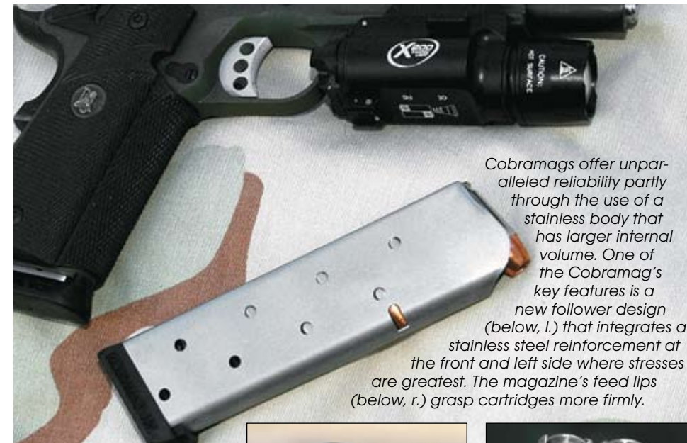
Cobramags offer unparalleled reliability partly through the use of a stainless body that has larger internal volume. One of the Cobramag's key features is a new follower design (below, l.) that integrates a stainless steel reinforcement at the front and left side where stresses are greatest. The magazine's feed lips (below, r.) grasp cartridges more firmly.

John M. Browning designed his M1911 to feed ball ammunition before hollow-point and lead semi-wadcuter ammunition came on the scene. Many prudent M1911 owners had the feed ramps of their pistols polished and the chamber mouths relieved to ensure the pistols would reliably feed such ammunition.