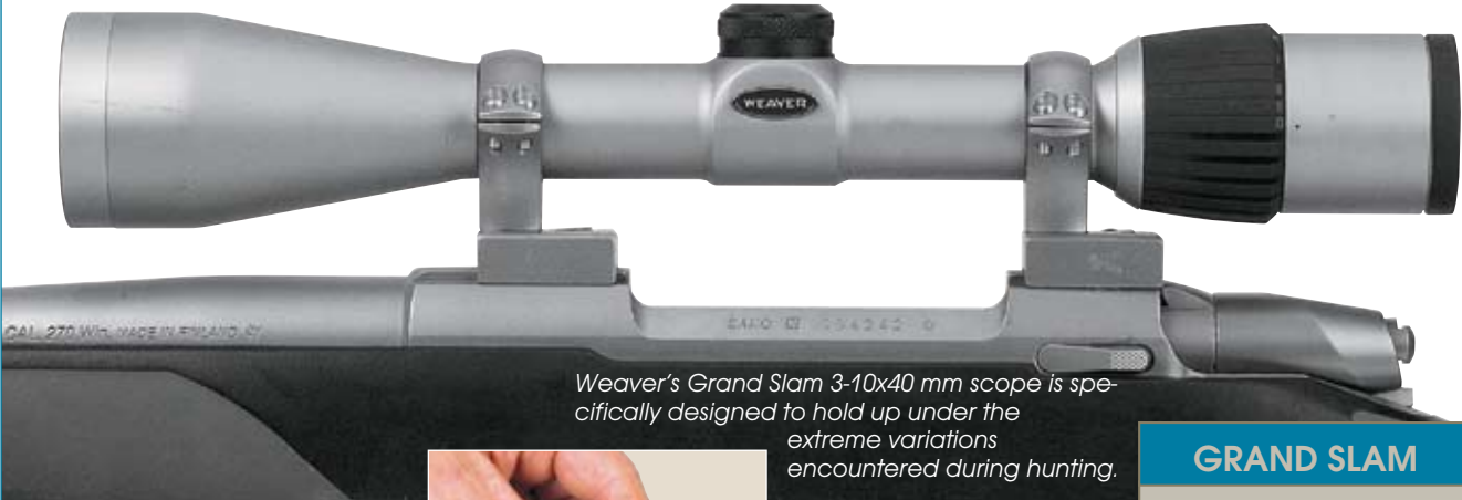
Weaver's Grand Slam 3-10x40 mm scope is specifically designed to hold up under the extreme variations encountered during hunting.

Over the past 70 years, Weaver has built a reputation for solid dependability and good value, but not much prestige. The Meade Telescope Company that now owns Weaver intends to improve that image.