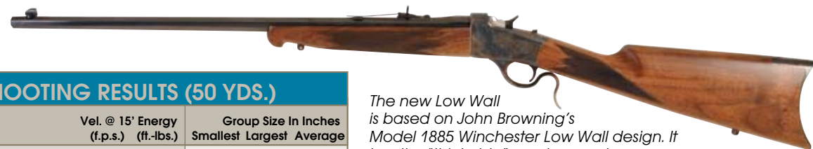
The new Low Wall is based on John Browning's Model 1885 Winchester Low Wall design. It has the "thick side" receiver contour.

a rear-facing, somewhat fine brass bead that is drift-adjustable for windage. The rear is an elevator-adjustable buckhorn unit with a fine opening at its center. It, too, is drift-adjustable for windage, and its elevator has five steps. The tang, by the way, is tapped to accept a tang-mounted peep rear sight, and the barrel and receiver are tapped to accept scope bases as well.