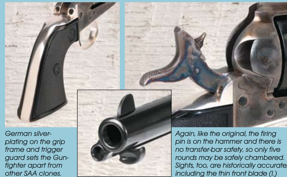
German silver-plating on the grip frame and trigger guard sets the Gunfighter apart from other SAA clones.