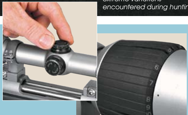
We found the Grand Slam's 1/4-m.o.a. adjustments positive and accurate (l.), but the variable power graduation markings (r.) were too small to be easily read in low light.

The foundation of the Grand Slam series is a one-piece scope tube that not only adds strength, but provides a waterproof housing for the optics. The ends and all other openings, such as windage and elevation adjustment controls, are double sealed with O-rings and gaskets to further inhibit leakage. As Weaver's top-of-the-line scope, the Grand Slam series features its best